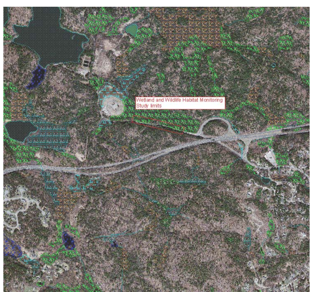
Figure 1: Study Limits

The study area extends approximately 1,100 feet west of the commencement of new paving and extends into wetland areas to the north and south a maximum of 120 feet from the edge of pavement as shown in Figure 1 below.