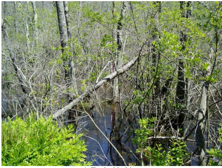
1. Typical habitat

The north side of the study area consists of an extensive forested wetland system known as Maple Swamp (see Figure 2). Using the classification system established in "Classification of Wetlands and Deepwater Habitats of the United States" (Cowardin, et al 1985), the site is a Palustrine scrub-shrub, seasonally flooded wetland. The area contains a moderate to sparse overstory of red maple ( Acer rubrum ) with a moderate to dense understory of shrubs, winterberry ( Ilex verticillata ) and northern arrow-wood ( Viburnum recognitum ) with sweet pepperbush ( Clethra alnifolia ), speckled alder ( Alnus rugosa ) and poison ivy ( Toxicodendron radicans ) near the road shoulder. Other vegetation includes royal fern ( Osmunda regalis ), bulrush ( Scirpus sp. ) and blueflag iris ( Iris versicolor ). Common reed ( Phragmites australis ) is found on the road shoulder and edge of wetland in the northwestern part of the project area.