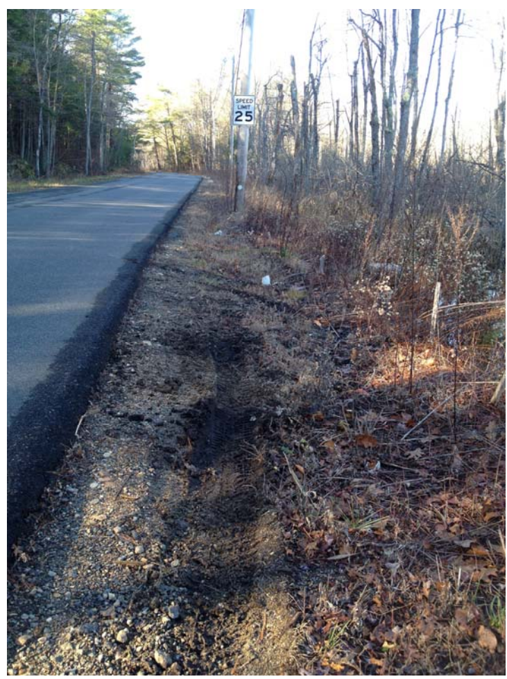
Road shoulder on north side of Pine Street in study area. Erosion control sock and stakes remain in place but have deteriorated

There did not appear to be any functional deficits of this wetland system as a result of activities conducted by MECT. Poor water quality at the two outlets indicates that sediment is still likely entering the system. Some erosion and bare spots on the roadway shoulder was also observed.