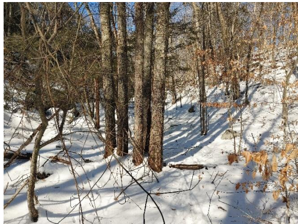
Left Photograph: Upland auger pull from low-lying area in southeast portion of the Property. Right Photograph: Red maple (Acer rubrum) stand in upland swale east of WF-A Series. Photographs dated February 9, 2022.