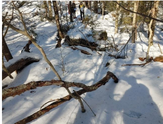
View facing northwest from Flag A-46 (proposed leaching connection). Photograph dated February 9, 2022.