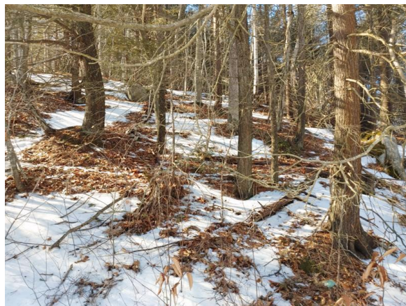
Left Photograph: View facing southeast of proposed Site Entrance. Right Photograph: Sample upland conditions in the northerly portion of the Property. Photographs dated February 9, 2022.