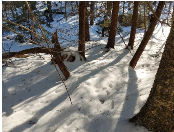
View from Flag A26 facing east of approximate vernal pool boundary defined by an elevated landform. Photograph dated February 9, 2022.

Applicant Response: This vernal pool boundary was delineated on 4/1/22 and can be shown on an updated plan set.