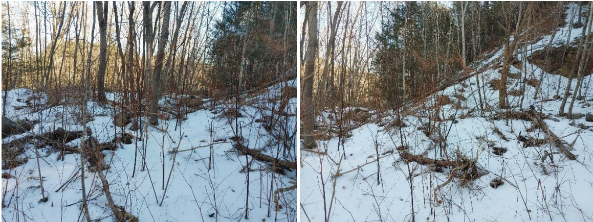
Both Photographs: Japanese knotweed (Fallopia japonica) and ledge south of WF-D Series facing east. Photographs dated February 9, 2022.

Multiple wetland resource areas occupy and bound the Property. These features include a Bordering Vegetated Wetland (BVW) in the northerly portion of the Property (D-Series) associated with the Mean Annual High Water (MAHW) of Sawmill Brook (R-Series). A large BVW in a topographic valley (A-Series) divides the northerly and southerly upland areas of the Property. An isolated wetland (labeled on the plans as both Isolated Land Subject to Flooding (ILSF) and a Vernal Pool (B-Series)) is situated in the southerly portion of the Property.