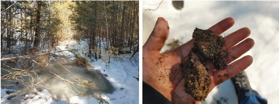
Left Photograph: View of C-Series upland feature facing north.