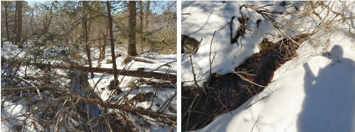
Left Photograph: View facing south of intermittent stream existing the B-Series Wetland. Right Photograph: View facing northwest of intermittent stream proximate to B-23. Photographs dated February 9, 2022.