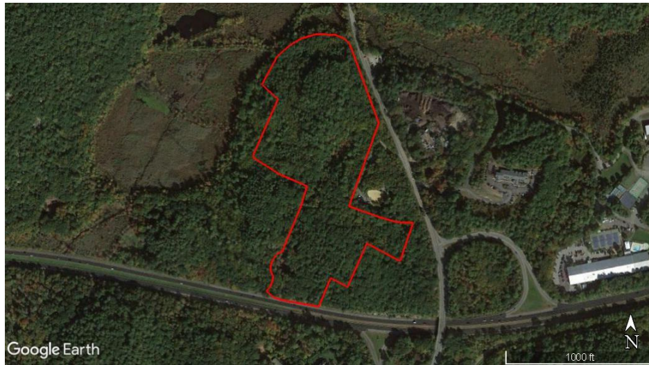
Google Earth Aerial Image with Approximate Property Boundary Highlighted.