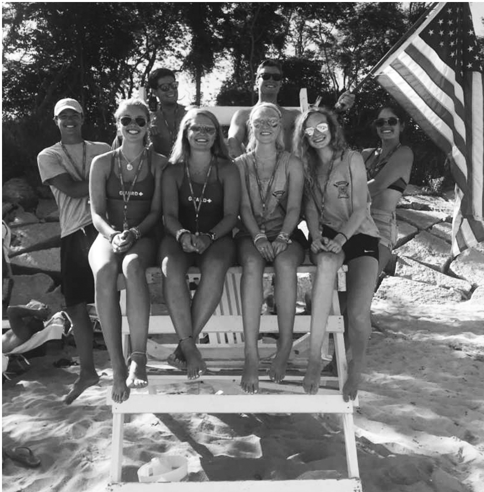
Lifeguards at Singing Beach