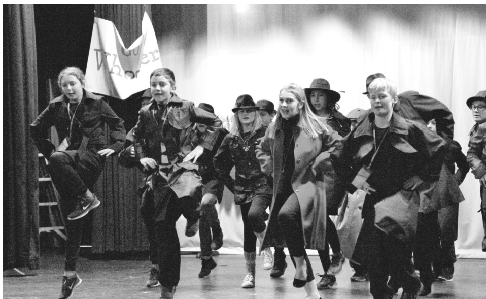
5th grade students performing The Grunch at Manchester Memorial School.

During the 2017-18 school year, the Manchester-Essex Regional Middle School (MERMS) began implementing recommenda-