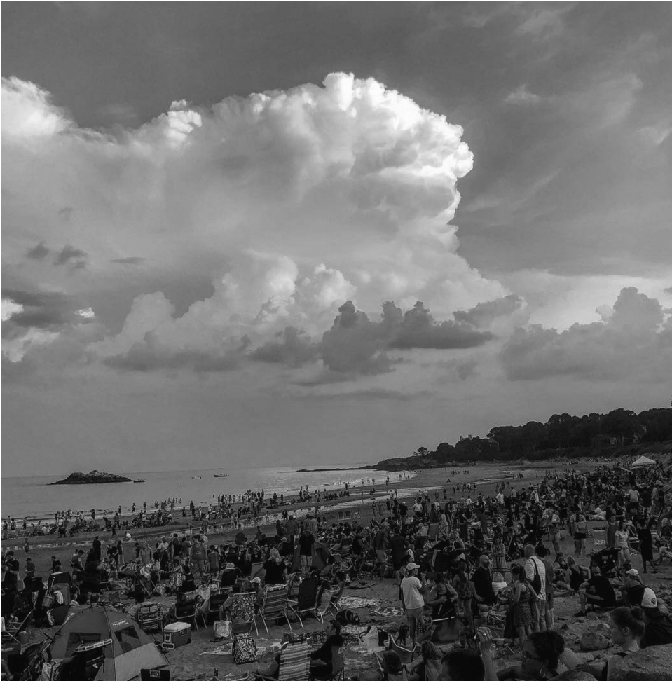
Singing Beach before the spectacular fireworks display on July 3, 2018.