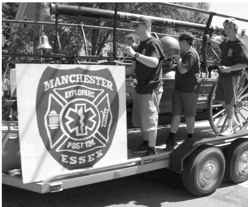
The Manchester Essex Fire Explorers mounted a float with an old hand-powered pumper called Essex #2 during Manchester 2018 4th of July parade.