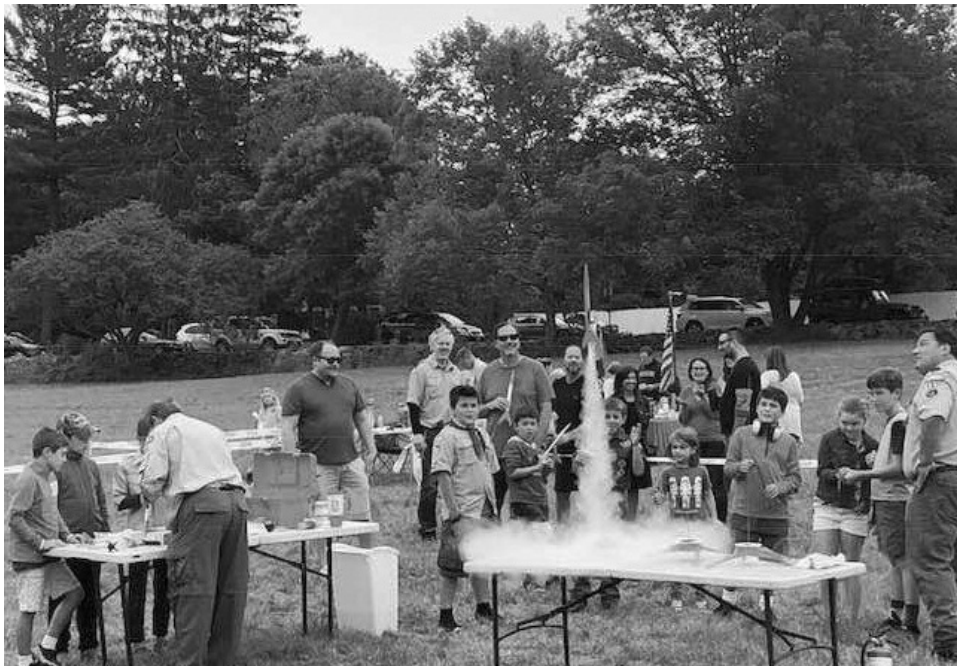
Cub Scouts launch rockets at their annual event at Winthrop Field