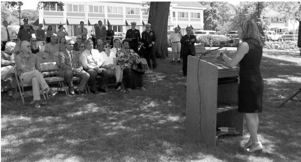
Lt. Governor Karyn Polito speaking at the ribbon cutting ceremony celebrating the completion of the Manchester Harbor Dredging project partially paid for by a $500,000 state grant.